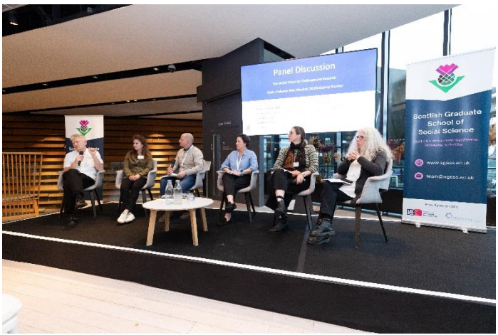
Panel session at the 2024 Collaboration Showcase, V&A Dundee

Image description: a group of six people sit in a row of chairs on a stage, facing the camera. One person is holding a microphone and talking to the audience. In the background there is a computer screen which displays a slide saying, "Panel Session."