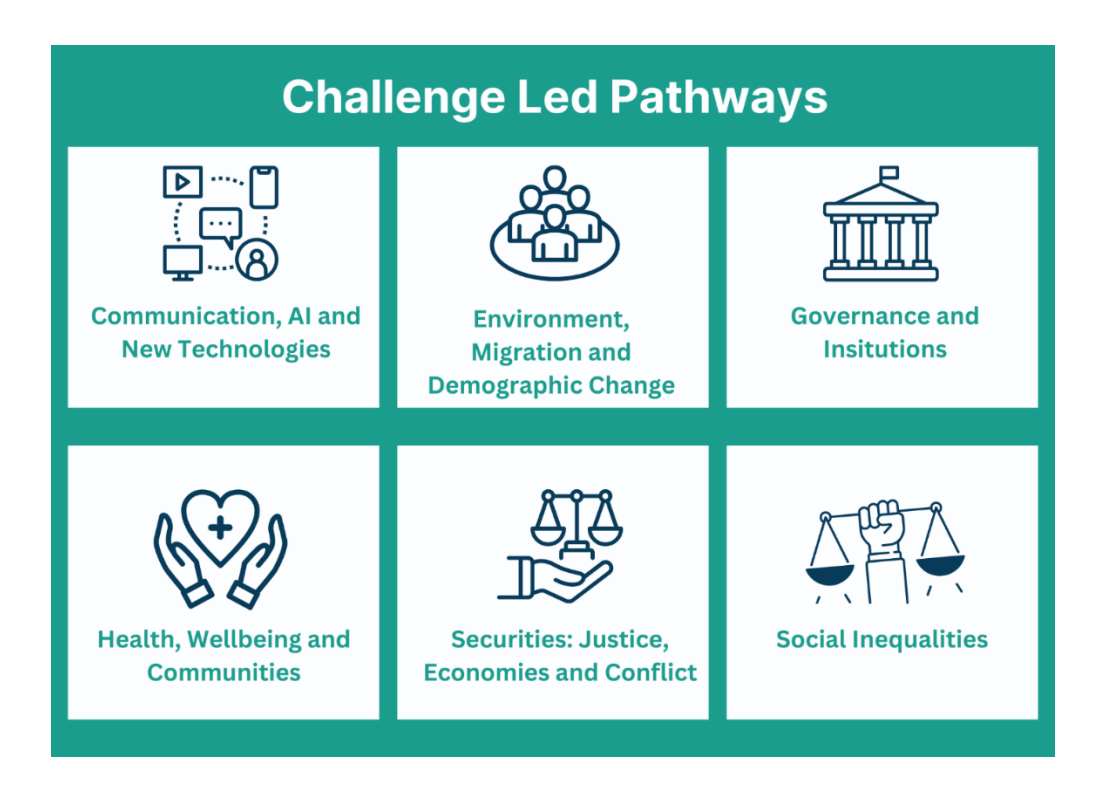
Image description: the six Challenge Led Pathway titles are shown: Communication, AI & New Technologies; Environment, Migration & Demographic Change; Governance & Institutions; Health, Wellbeing & Communities; Securities: Justice, Economies & Conflict; Social Inequalities.

Continuing students were paired into a pathway, while those starting this October indicated their preference at time of application. Those on the pathways will come together virtually and face-to-face to share peer-learning on theoretical, conceptual and methodological issues with a focus on communication of ideas beyond discipline. The prioritisation of learning would come from students' own development needs and those created collectively through early cohort development.